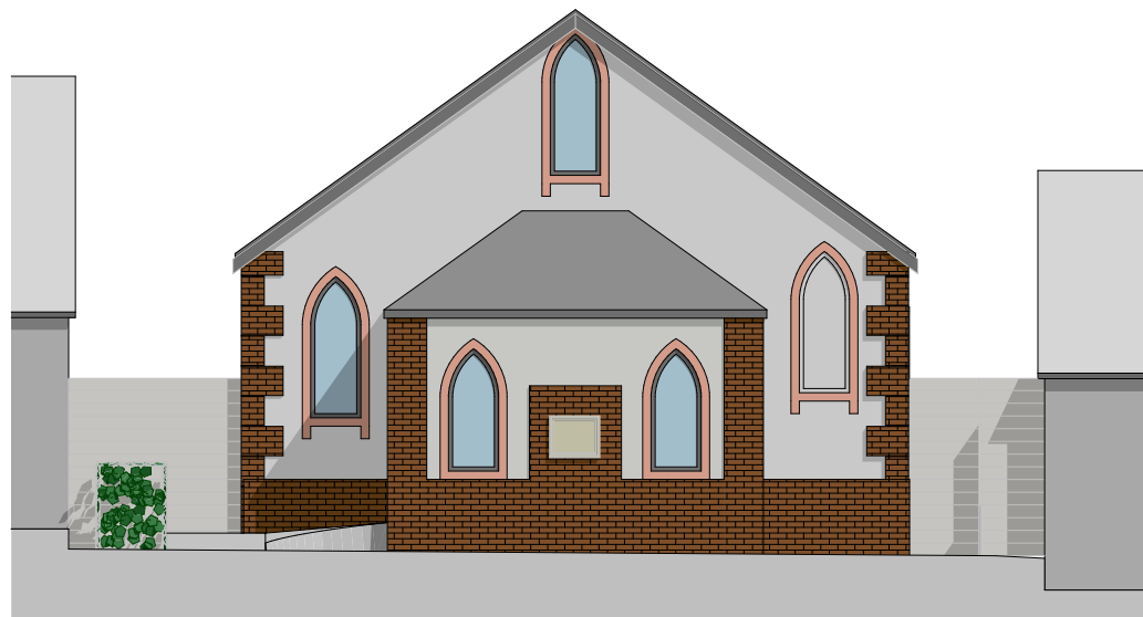
Proposed East Elevation