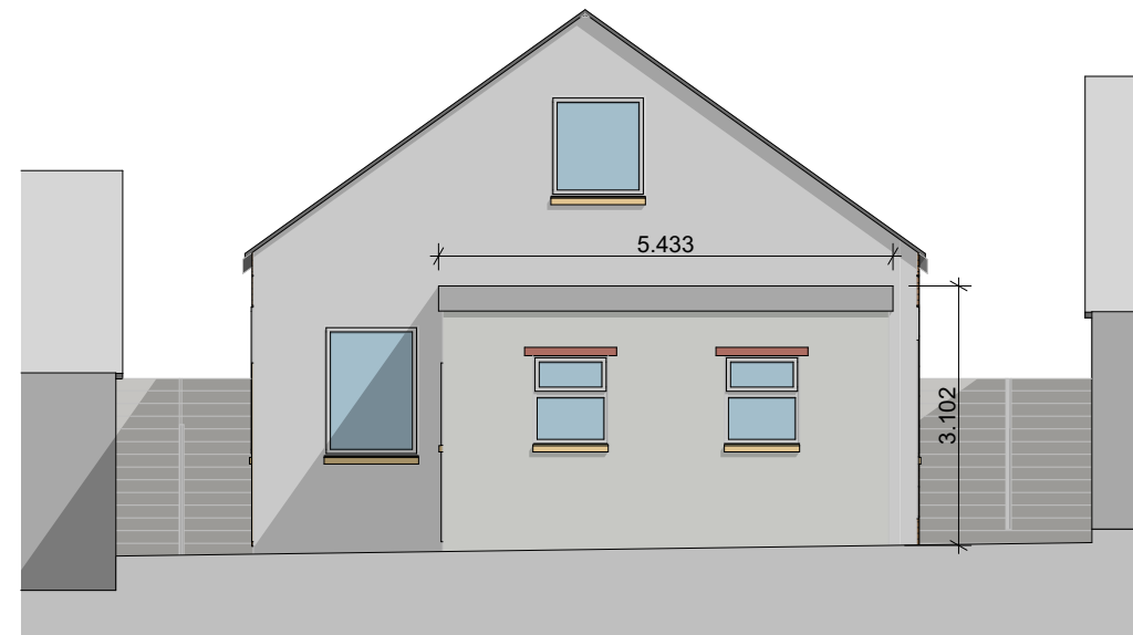
Proposed West Elevation